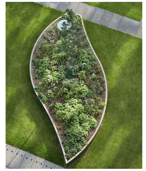
Floradrain® FD 40-E elements were installed under the lawn areas, while the planting beds which offer more substrate depth for shrubs and trees were built on Floradrain® FD 60.

The special design of the raised beds enclosed with Tombak provides a unique character to the garden. The inspiration for this design stirred from the nearby shore with its water and its waves. The resulting new roof garden is lush and green and the wave-like shapes of the beds provide an interesting contrast to the strict construction of the buildings.