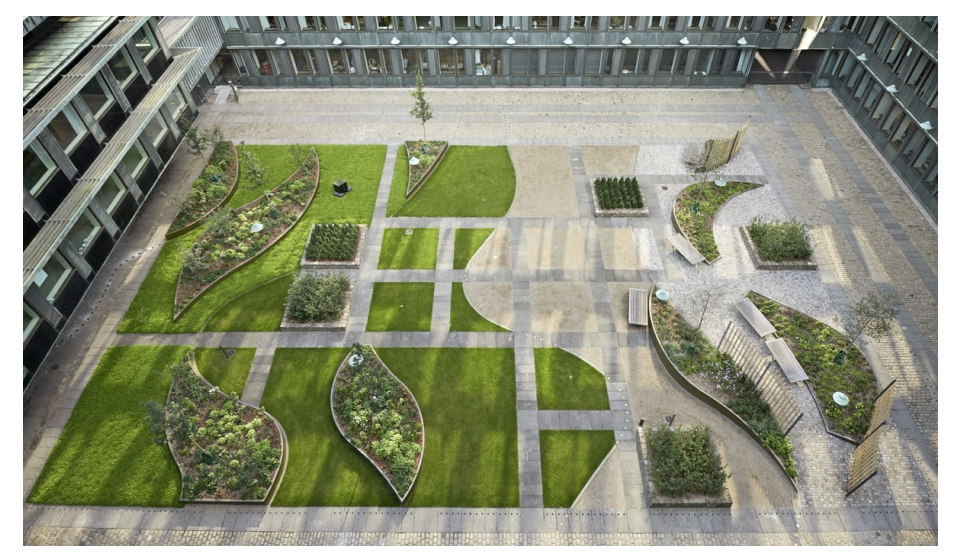
Seen from above, one can recognize the wavelike shapes of the planting beds.